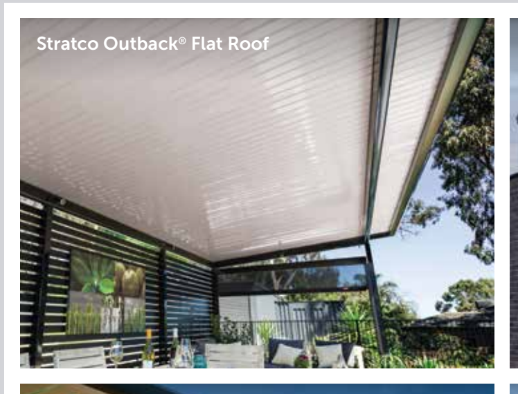
Outback Cooldek<sup>®</sup> Insulated Roofing